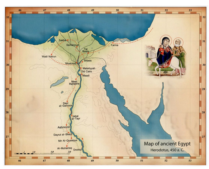
The Path of the Holy Family in Egypt Prepared by the Nuns of St. George Convent (Old Cairo) Concord Press. 2020

Three virtual programmes will take viewers on the journey of the Holy Family from different perspectives. Sessions will be held on three consecutive Thursdays from 7-8:30 PM. Information and registration will be emailed in the first week of September. All sessions will be held in English. The first and third sessions are also available in French on request: