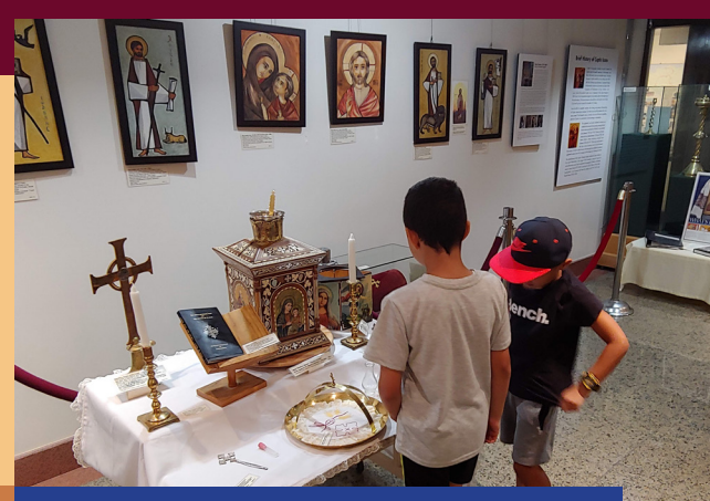
Children view a display of the Museum's liturgical vessels collection used in the early history of St. Mark's Coptic Orthodox Church