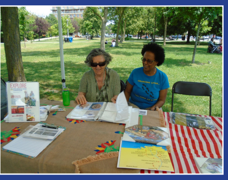
Promoting the Museum at the Ethiopian Community Annual Gathering at Christie Pits, Toronto. (see Museum Facebook)