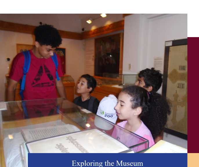
Exploring the Museum

In this issue of the Newsletter we are highlighting some of this summer's visitors and outreach activities.