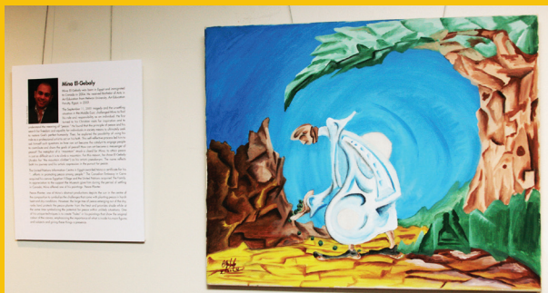
Peace Planter.