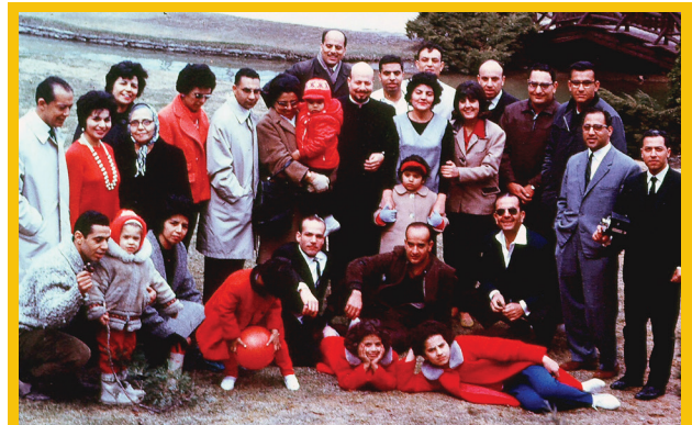
Copts celebrate Easter in High Park, 1965.

Ten panels also gave the stories of challenges and achievements of nineteen Canadian Copts who have joined the Culture sector in Toronto and elsewhere in North America. Some arrived in Canada as seasoned artists and museum professionals or were children of immigrant parents who went through the Canadian educational system. A striking theme that cuts across all their stories is their determination to pursue a career where they could express their gifts as artists and passion for art despite the fact that such careers are not traditional professions for Copts and most of them were advised not to pursue careers