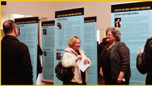
Copts in the Culture Sector Panels.